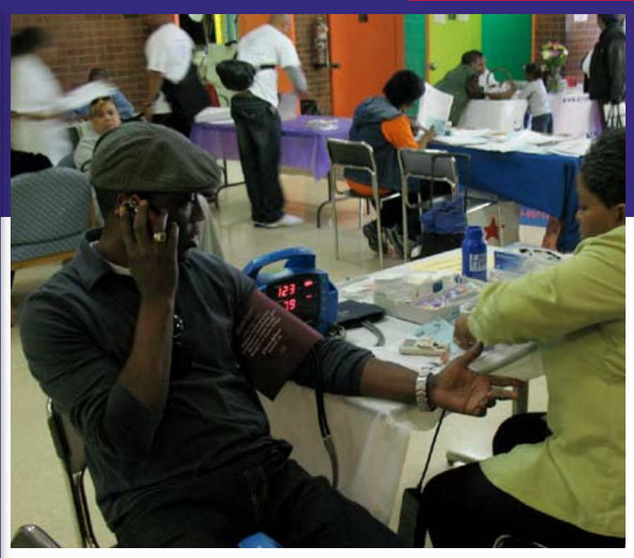
HEALTH ASSESSMENT SCREENING - HARLEM NYC, NY