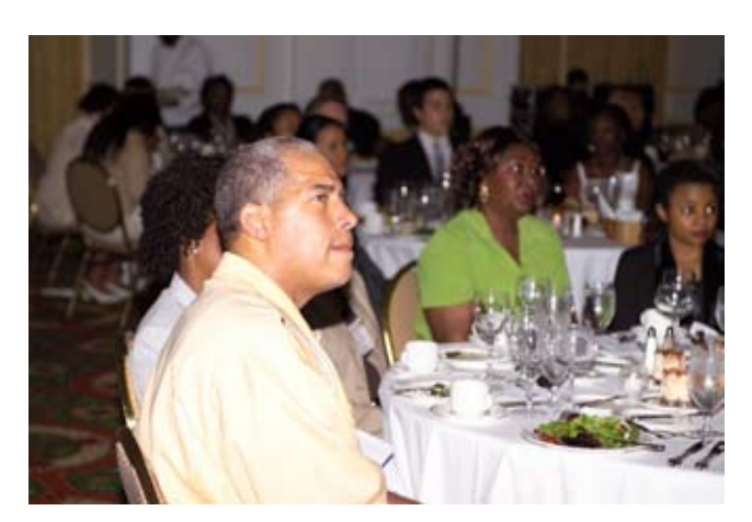
COMMUNITY LEADERS FORUM - WASHINGTON, D.C.

CCORDING TO the American Heart Association, one in three Americans have one of more types of cardiovascular disease. Key civic, corporate, and religious leaders in Harlem, New York, Jackson, Mississippi, and Washington, DC joined the Association of Black Cardiologists in convening a community leaders forum in each of these cities to address the high rates of death and disability from cardiovascular related diseases in their respective communities. The forum, developed by the ABC and supported by AstraZeneca, is one component of the Super Weekend 2008 initiative to achieve reduction in the prevalence of cardiovascular diseases through aggressive education and screening. The programs are developed to emphasize that both the healthcare professional and the patient share equally in health outcomes related to CVD. A multi-event program, Super Weekend 2008 is designed to educate the professional in advances in cardiovascular diagnosis, treatment, and management, as well as, empower community leaders and consumers/patients with knowledge that leads to behavioral lifestyle changes that extends and improves the quality of life.